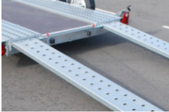
PULL OUT / PUSH IN EASY TO OPERATE RAMPS WITH PRG SUPER GRIP