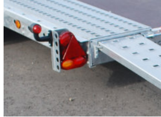
WELL PROTECTED LIGHTING SYSTEM WITH "SUPERSEAL" WIRING CONNECTIONS