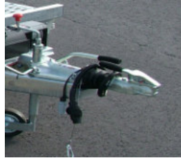
BRADLEY AUTO LOCK CAST BODY AND CAST HEAD COUPLING